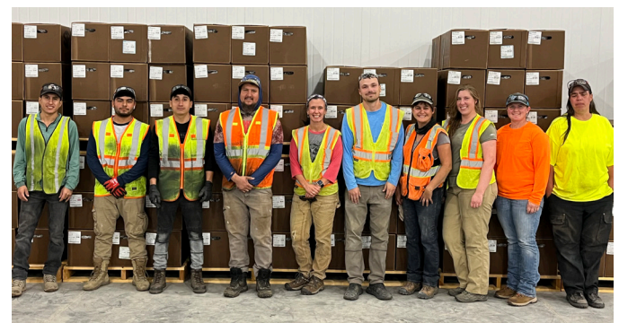
Nursery Crew after first day of packing season, October 2024

As we enter 2025, we are excited to build upon these successes and continue driving innovation, sustainability, and growth across all areas of the Company.