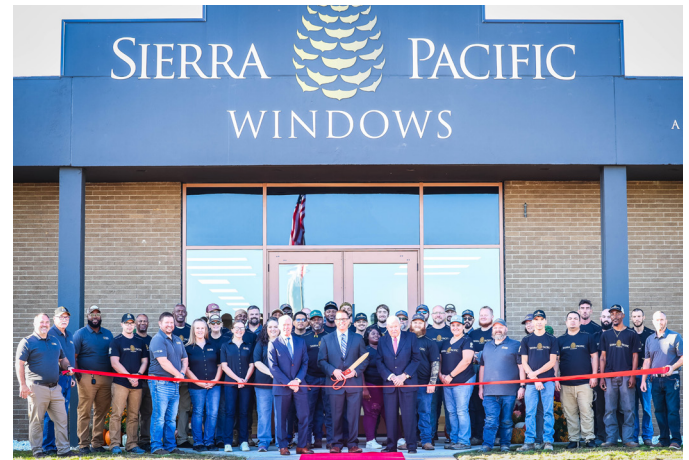
Phenix City Crew celebrating Ribbon Cutting, October 2024

Additionally, 2024 underscored the importance of wildfire resilience and preparation. Our continued investment in vegetation management projects and our over 2,000 miles of fuel breaks helped mitigate wildfire impacts on SPI timberlands and our surrounding communities. We remain committed to expanding these initiatives in collaboration with neighboring landowners to proactively safeguard our landscapes and communities.