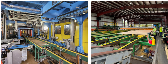
Shelton Auto Paper Wrap Machine and Anderson Planer Line

Looking ahead to 2025, several mills are scheduled to receive auto wrap machines: Aberdeen, Burlington, Burney, Centralia, Lincoln and Quincy. Additional projects include a new sorter/package line in Quincy and boiler upgrades in Sonora, both targeting completion in 2025. Long-term initiatives, such as the construction of new stud and large log sawmills in Eugene remain underway with extended timelines.